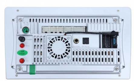
Head Unit Back Side