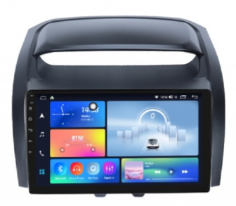
Head Unit Front Side